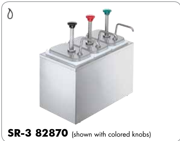
SR-3 82870 (shown with colored knobs)