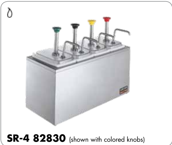
SR-4 82830 (shown with colored knobs)